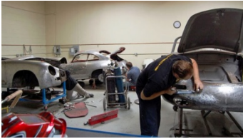
Metal and fabrication

Our first technical outing for the year will be to the CPR Classic Porsche Restoration facility in Fallbrook, CA . CPR is one of the premier Porsche automobile restoration shops in Southern California. We will see the restoration process from disassembly to final reassembly of vintage Porsches.