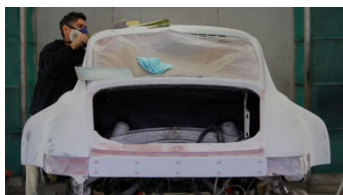
Prep for paint