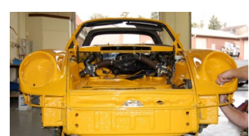
Assembly and electrical