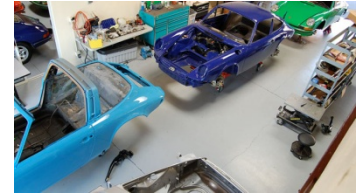
Rolling chassis for re-assembly